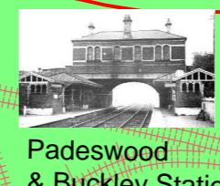
Padeswood & Buckley Station