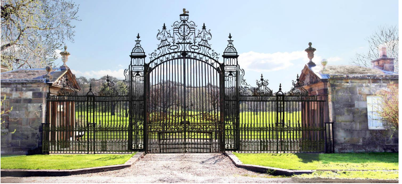
ORIGINAL BLACK GATES - SIMULATED