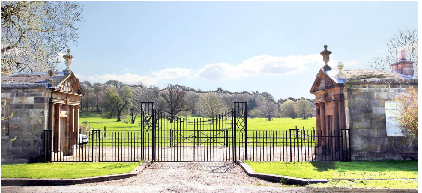
PRESENT BLACK GATES